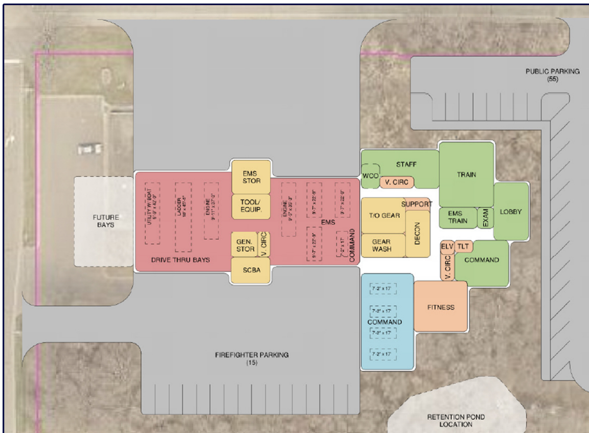
Preliminary North Station Design

Maplewood Fire/EMS is reducing from three stations to two. This will eliminate coverage overlaps at stations two (central) and three (north) and maximize efficiencies.