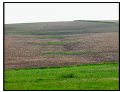
Water & Sediment Control Basin ( Std. 638 )