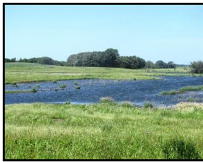
Wetland Restoration ( Std. 657 ) or Impoundment