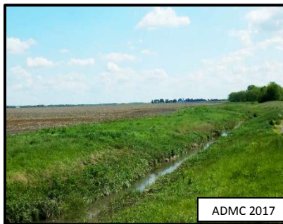
Saturated Buffer ( Std. 604 )