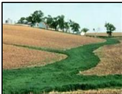
Grassed Waterway ( Std. 412 )