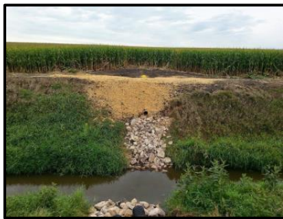
Side Inlet to a Ditch ( NRCS FOTG Std. 410 )