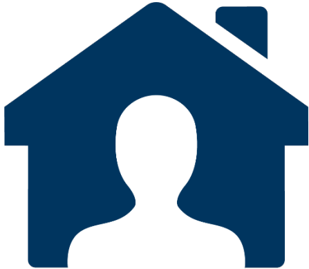
Increasing Housing and Employment Opportunities for Community Members with Criminal Records