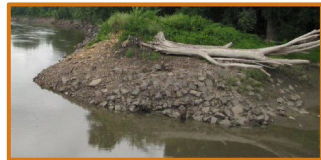
Erosion of the riverbank along the Minnesota River in the project area