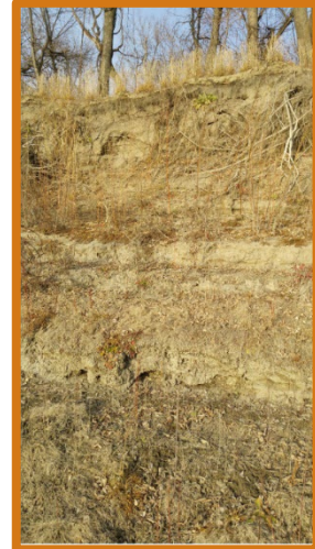
Cut bank due to erosion within the project area