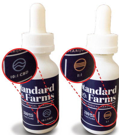
Figure 2. A patient reported frequently confusing these products with different ratios of THC and CBD because the labels look so similar. Also note the bottle on the left contains a 10:1 ratio, and the bottle on the right contains a 1:1 ratio, but both are labeled as a 330 mg tincture.

Percent concentrations. In addition to (or in place of) ratio expressions, some products are labeled with the percent concentration. This makes it difficult for staff in dispensaries and patients to calculate the amount of THC and/or CBD in the product. For example, would you be able to easily identify the amount of THC and/or CBD in 0.5 mL of a 0.037% product, especially if the mg/mL amount is not clearly listed? With some products, the mg amount of each primary ingredient can be found on container labels, which is preferred for dosing and consistency but could still cause confusion in patients who are more familiar with ratio expressions. It is critical to know the actual mg amount of each primary component, especially THC, which is most likely to elicit clinical and/or adverse effects. But too often, the mg amount of a liquid product is listed without a corresponding volume, preventing the ability to determine the concentration. And again, there is no standard. The Sidebar (right column, page 1) provides an example of this problem along with several other labeling issues.