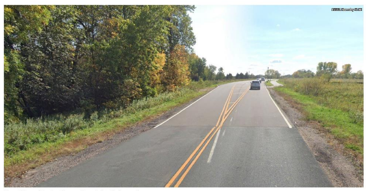
View of inconsistent section on Hornsby Ave facing south