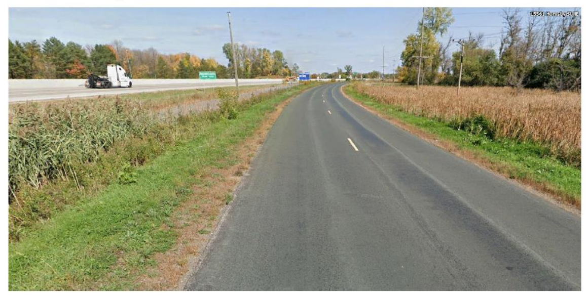
View on Hornsby Street facing north towards the city limits.