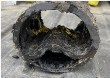
Orangeburg Sewer Service Pipe