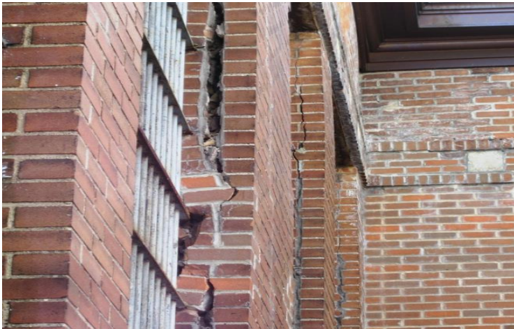
MCF – Stillwater Brick Failure