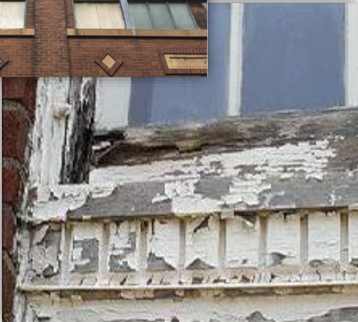
Windows in Living Units