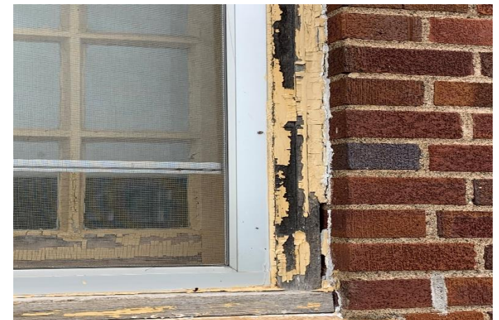
MCF – Moose Lake Windows