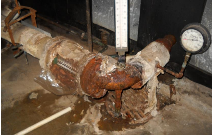
MCF-Oak Park Heights Piping