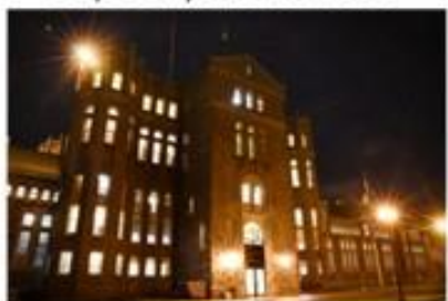
MCF-St. Cloud built 1889 capacity: 1,058