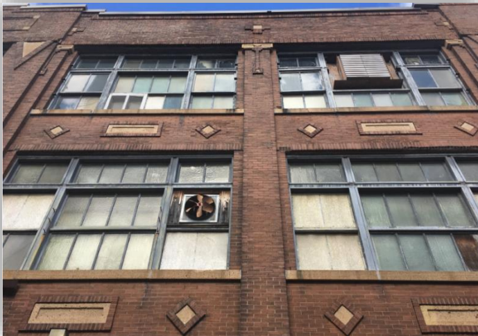
MCF-Stillwater Industry Building