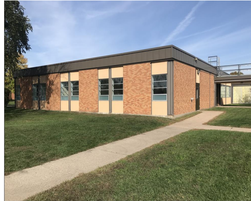
Lino Lakes – E Building