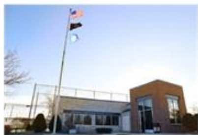
MCF-Faribault opened 1989 capacity: 2,026