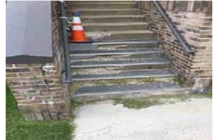
MCF – Shakopee Brick/Stair