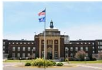
MCF-Moose Lake built 1938 capacity: 1,057