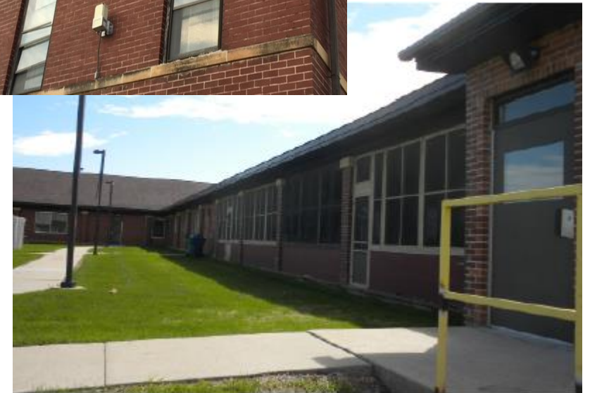
Dakota Building – Minimum Security