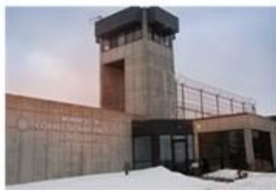
MCF-Lino Lakes built 1963 capacity: 1,325