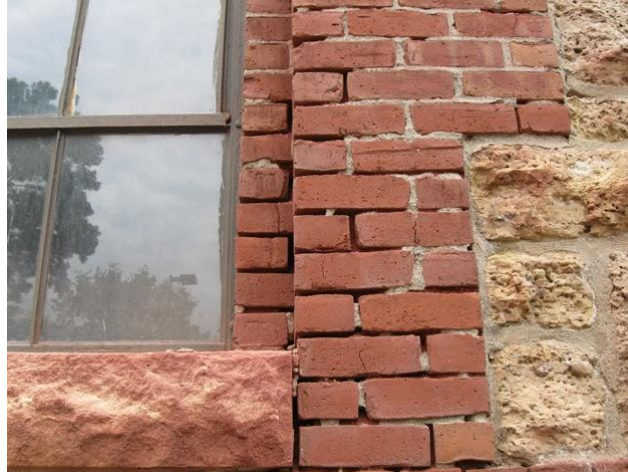
MCF – Red Wing Tuck Pointing