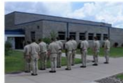
MCF-Willow River built 1951 capacity: 177