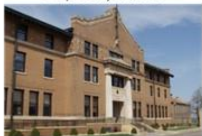
MCF-Stillwater built 1914 capacity: 1,561