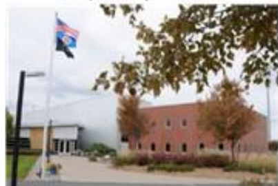
MCF-Rush City built 2000 capacity: 1,018