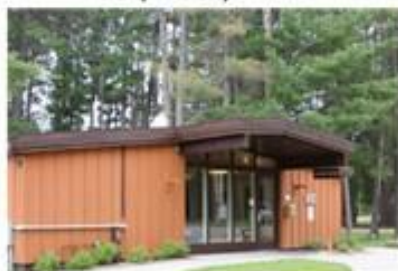
MCF-Togo built 1955 capacity: 90