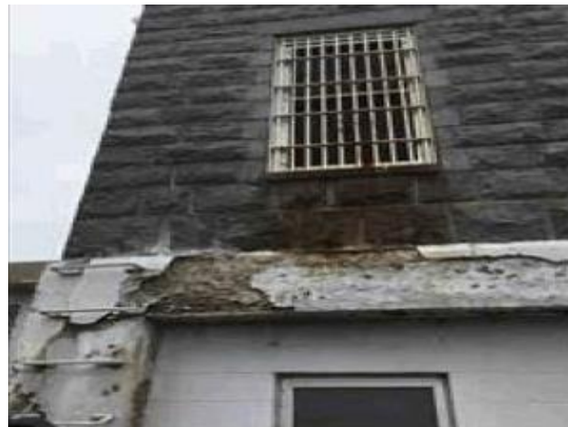
MCF – St. Cloud Wall Deterioration