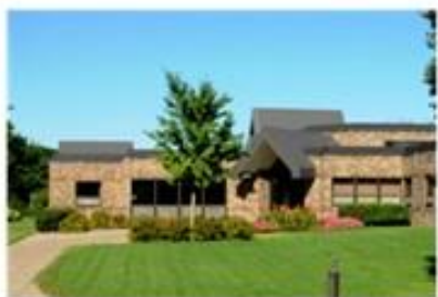
MCF-Shakopee built 1986 capacity: 656