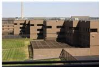
MCF-Oak Park Heights built 1982 capacity: 444