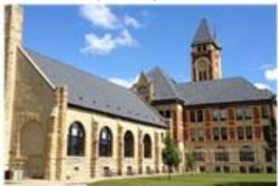
MCF-Red Wing built 1889 capacity: 42-A, 111-J