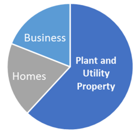
Tax base: Plant's final year