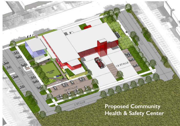
Proposed Community Health & Safety Center