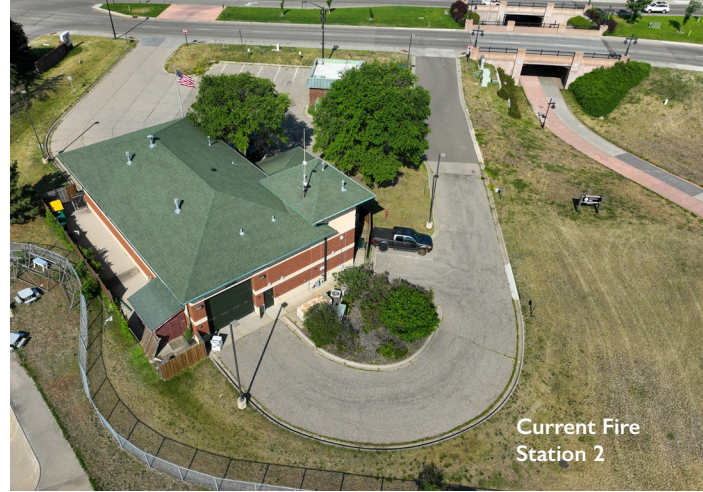
Current Fire Station 2