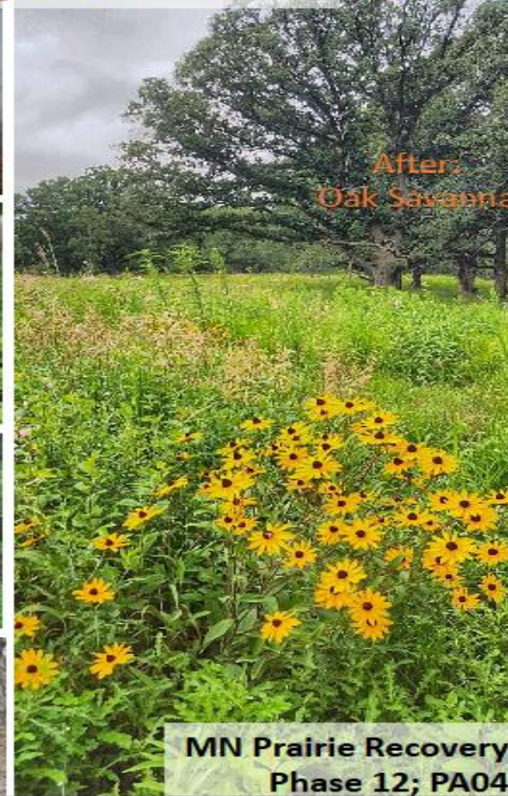
After: Oak Savanna