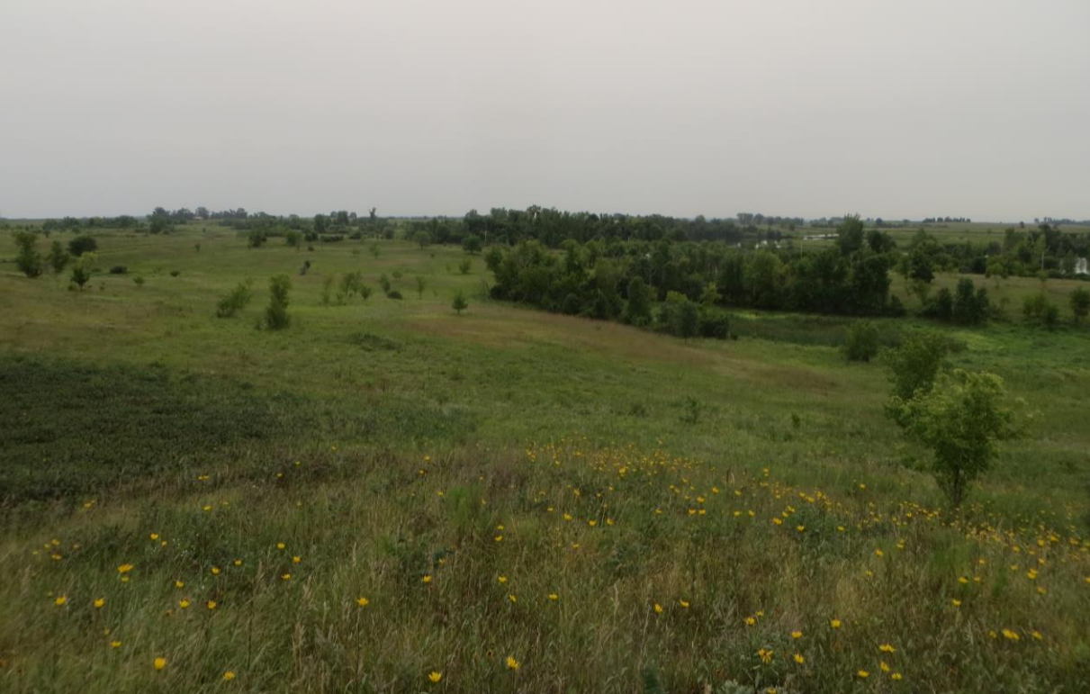
Before Tree Removal (Summer 2018)