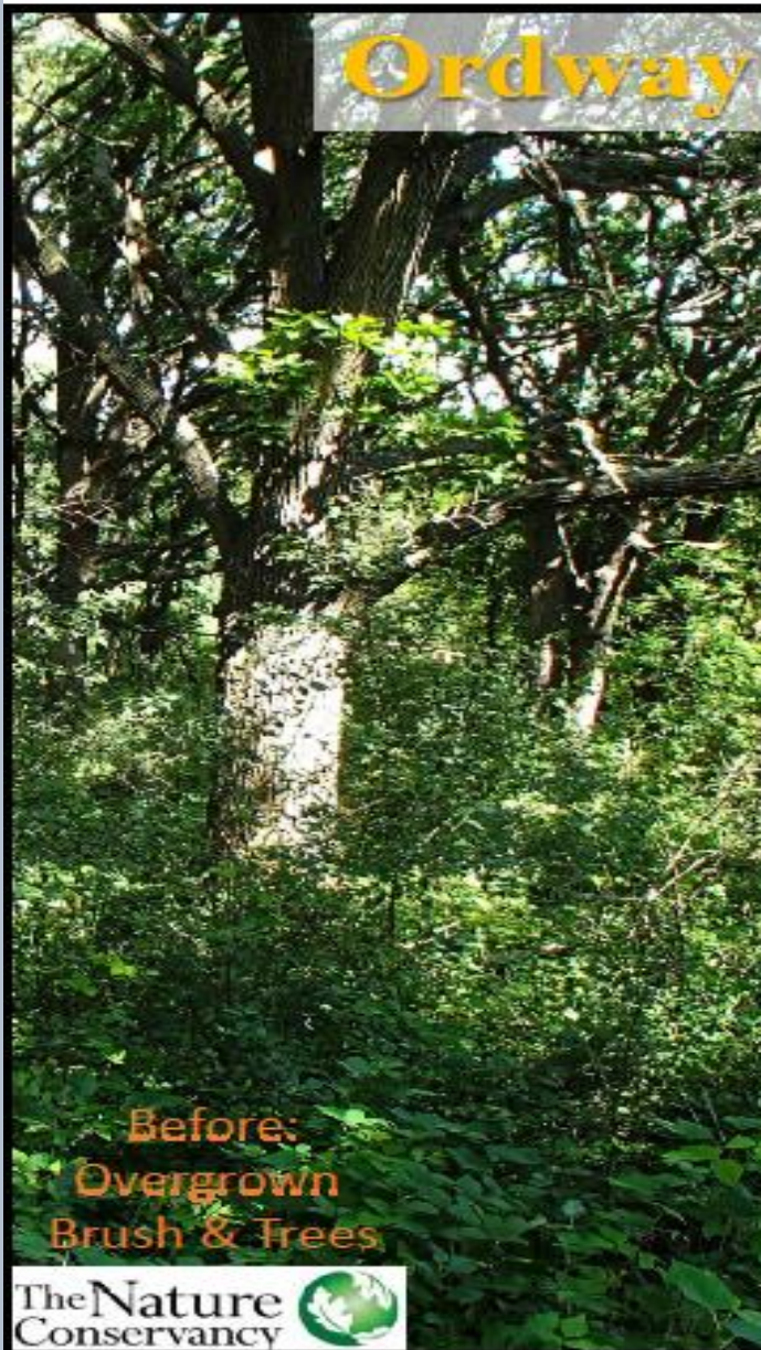
Before: Overgrown Brush & Trees