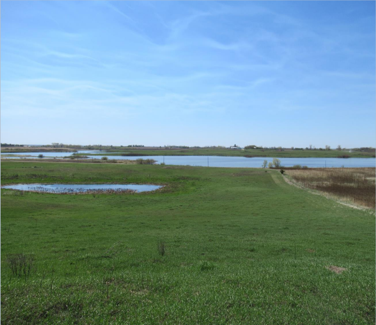
After Tree Removal & Prescribed Fire (Spring 2021)