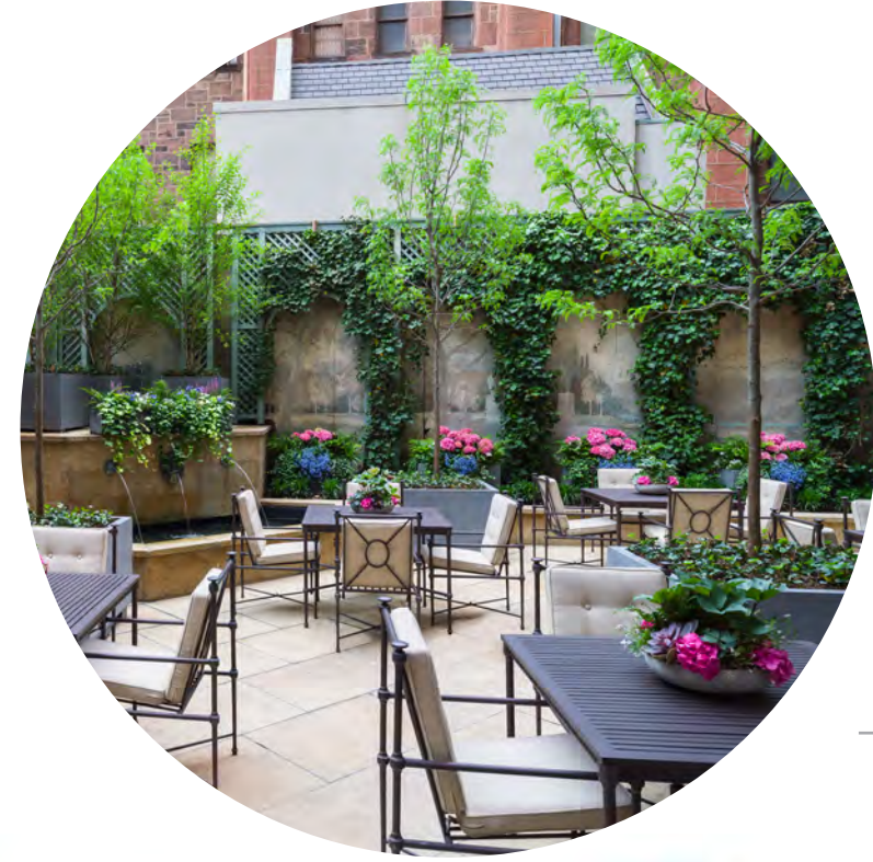
RESTAURANT PATIO SPACE EXAMPLES