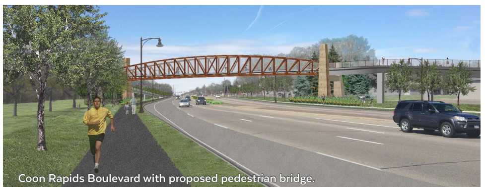
Coon Rapids Boulevard with proposed pedestrian bridge.

See how the pedestrian bridge will improve the connections between Coon Creek Regional Trail and Mississippi River Trail Bikeway (MRT) on page 2.