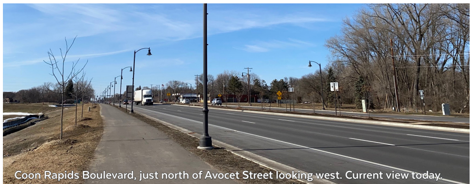
Coon Rapids Boulevard, just north of Avocet Street looking west. Current view today.

How Much State Funding is Being Requested? → $1.4 MILLION