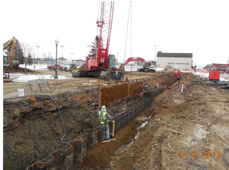
Flood Hazard Mitigation project in Austin, MN