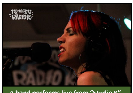
A band performs live from "Studio K" (produced by students) on Radio K