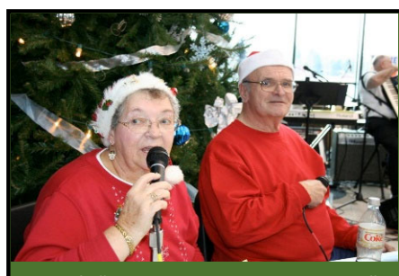
KSRQ's "Saturday Morning Barn Dance"