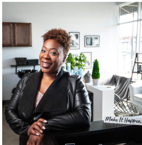
Consciously Beautiful, Frogtown Square