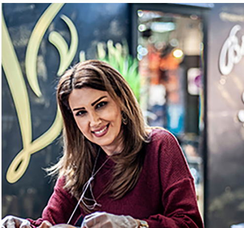
Leila's Brows, Midtown Global Market