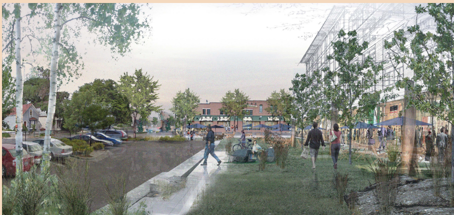
First look at the rendering for the new space and building

Join NACC in our efforts to combat inequitable healthcare and housing for Native American families