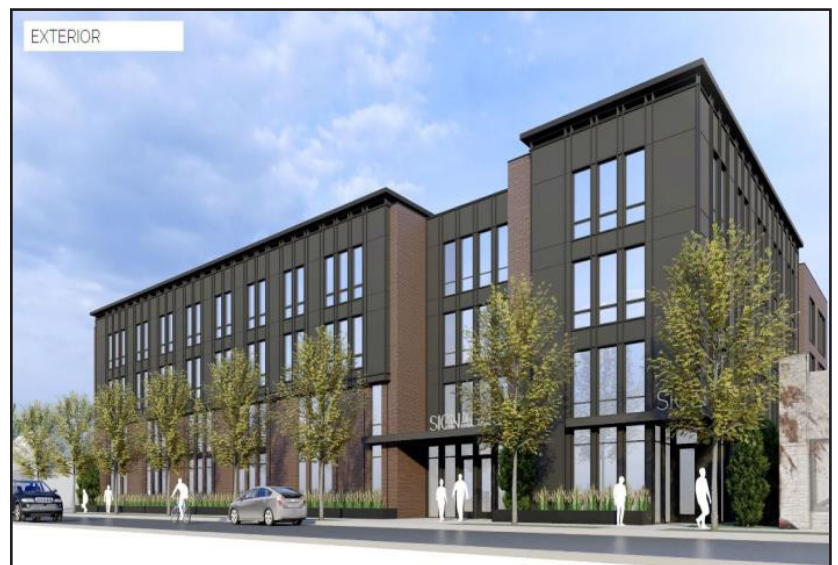
Rendering by UrbanWorks Architecture

Agate is building a source of hope and opportunity in the neighborhood most effected by the civil unrest following the murder of George Floyd.