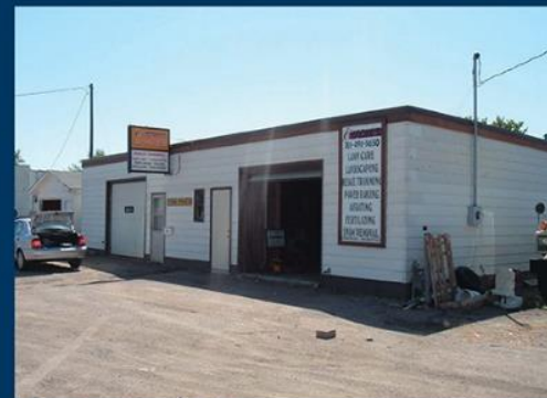
Moorhead site – Before