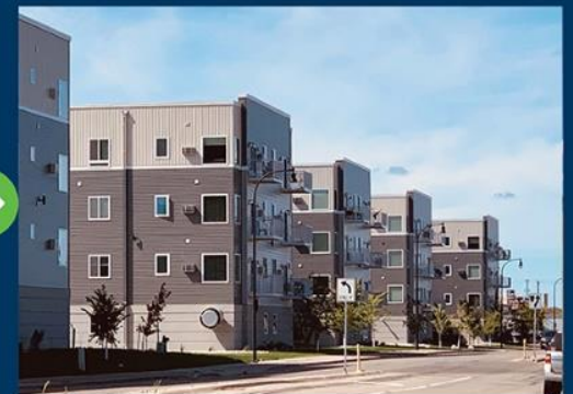
Moorhead site – After