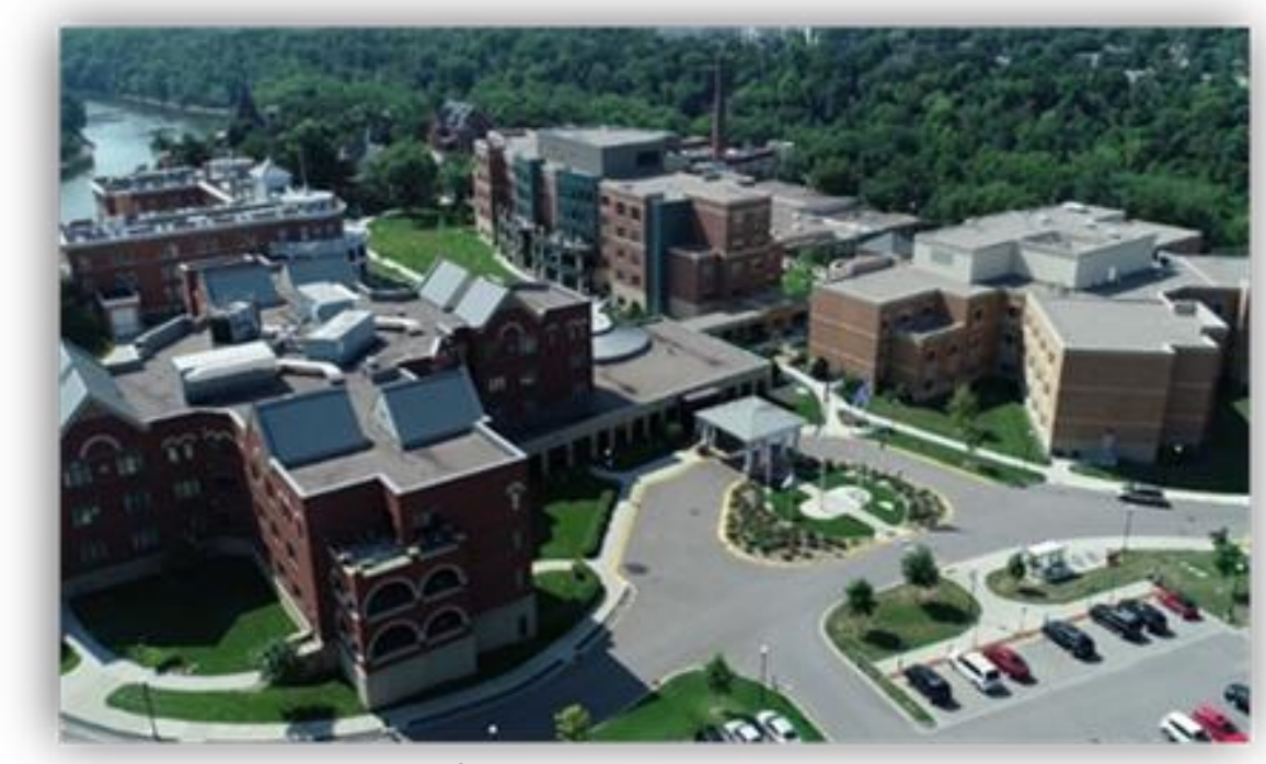
MVH – Minneapolis