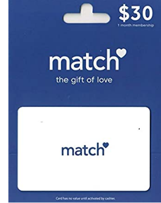
Consumers can buy Match.com gift cards at local retailers using the payment form they want

This can all be done without any involvement of the Apple and Google stores, so the argument that there is a "monopoly" on payments is false.