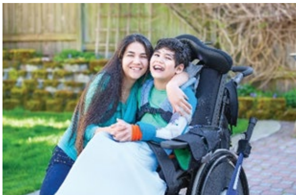
Mode 5: Lift-equipped/ramp transport