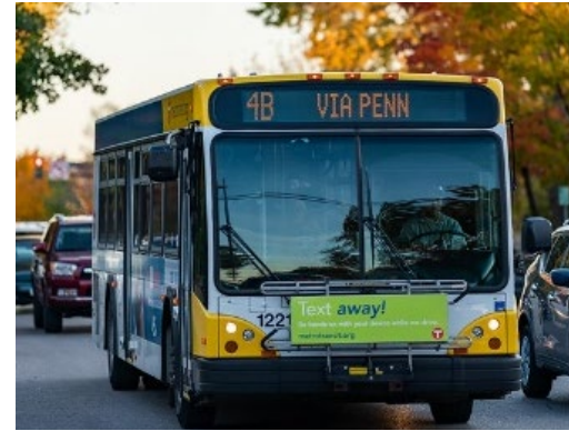
Mode 3: Unassisted transport