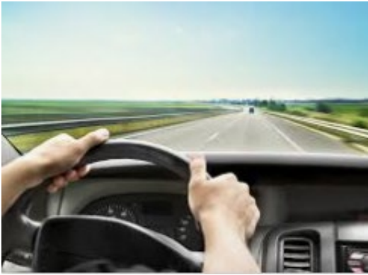
Mode 1: Client reimbursement