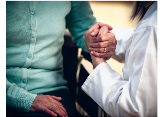
Mode 4: Assisted transport