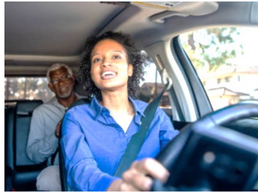
Mode 2: Volunteer transport