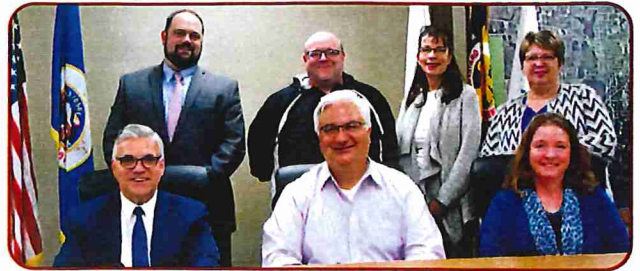
THE FAIRMONT AREA SCHOOL BOARD.

This Project is UNANIMOUSLY SUPPORTED by