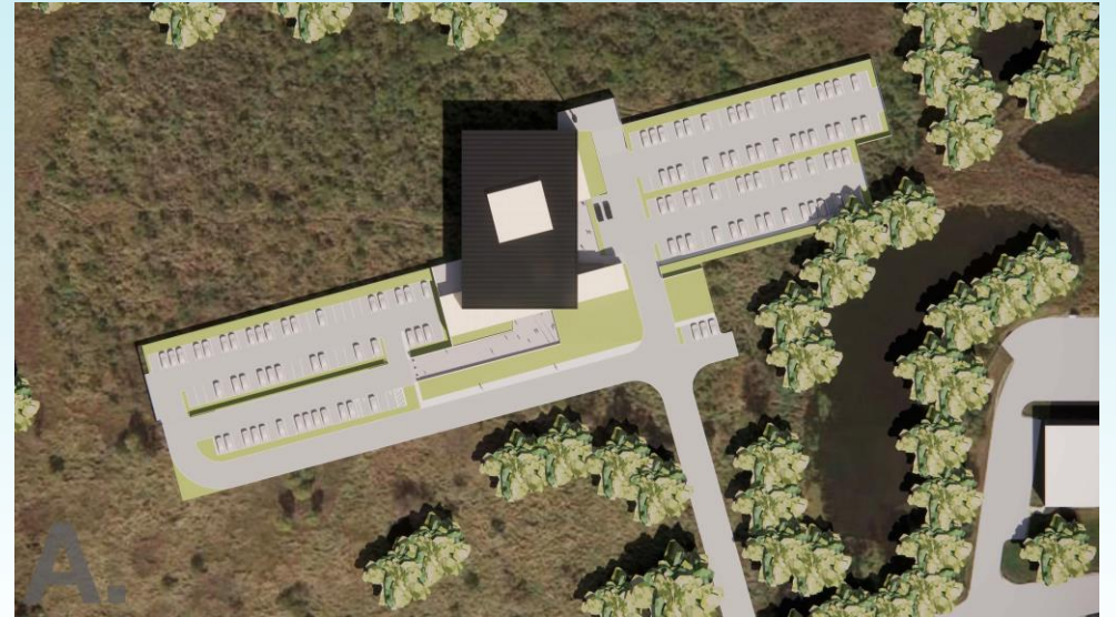
Design Rendering as of 12/2022