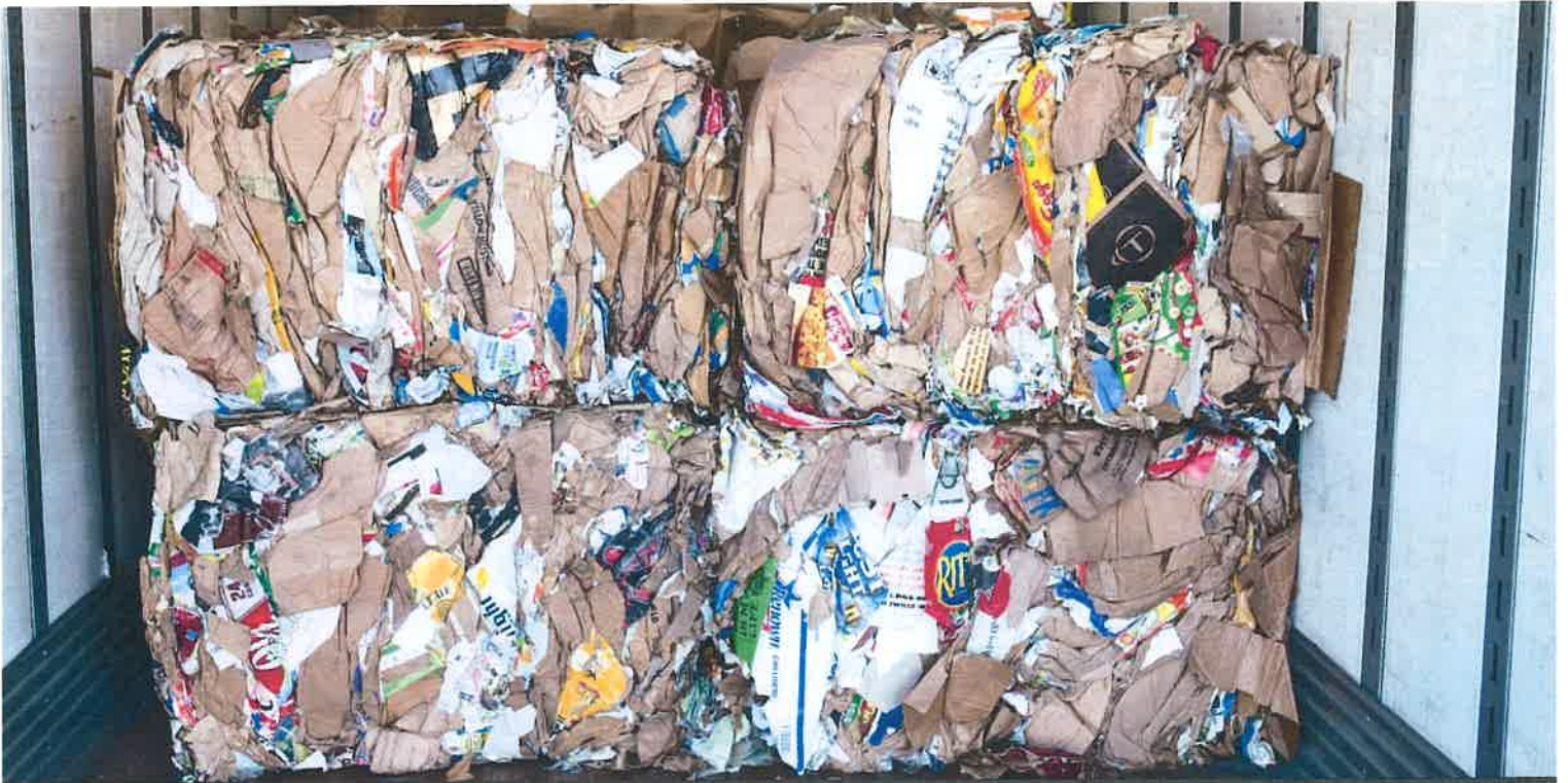
Liberty Paper is located next to Sherco Power Plant.