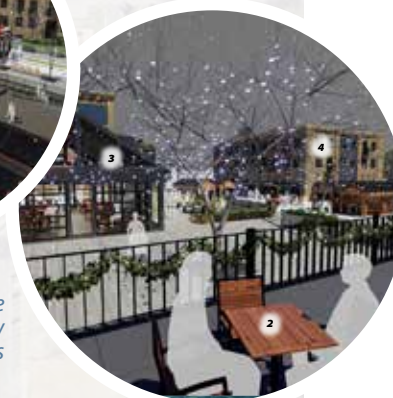
Views of the planned new public spaces