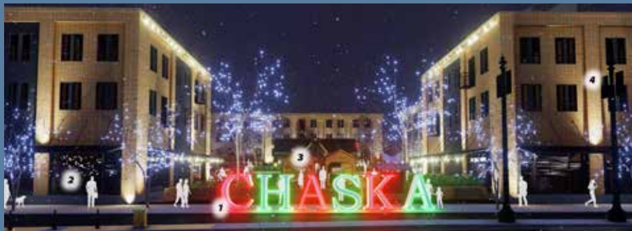
3D View of new public space from MN Highway 41

“The City Square West Redevelopment Project will be a major public gathering space and pedestrian connection that builds upon Chaska's legacy of investing in successful downtown improvements. ”