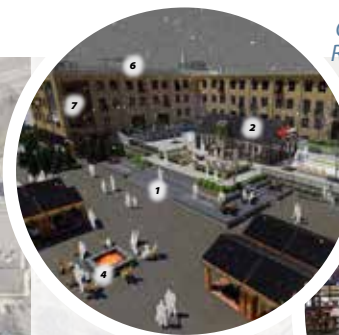
City Square West Redevelopment Concept