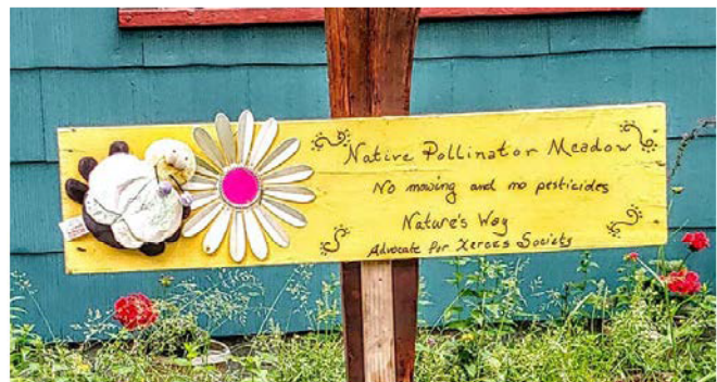
Above: Signs can go a long way toward acceptance of an “untidy” yard.

Below: Weeding can be a relaxing activity, giving you time to de-stress from daily life and the chance to carefully observe and appreciate the diversity of wildlife your garden supports.