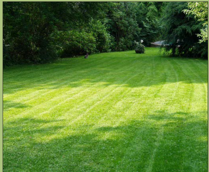
Although white Dutch clover is most obvious, the bee-friendly lawn on left has eight flowers that bloom through the spring and summer. In contrast, the lawn on the right offers little to support pollinators.