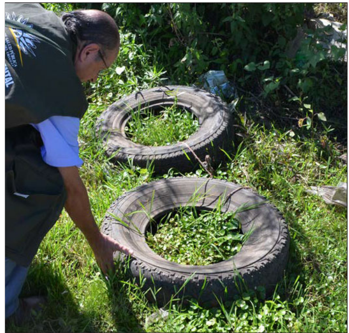
The most effective way to reduce the number of mosquitoes is to remove potential breeding places. Any object in which water can puddle, including old tires, buckets, and flower pots, may be used by mosquitoes. Dump water from these places at least once a week.

As pollinators move through the landscape they encounter many hazards, including disease, pesticides, and lack of forage and nesting sites. By creating a pollinator garden, you are providing them a safe oasis. Pollinator-friendly yards also inspire curiosity and foster awareness. Once your neighbors see yours, they might decide to add a few pollinator plants in their yard. In some communities, neighbors have combined their efforts to purposefully expand habitats to create corridors that help expand the range of these beneficial species. In this digital age, you can even inspire people far away by sharing your garden through the Xerces Society's Bring Back the Pollinators campaign, a forum celebrating pollinator gardens across the country. And, of course, be sure to take a few moments every day to marvel at the diversity of insects right under your nose.