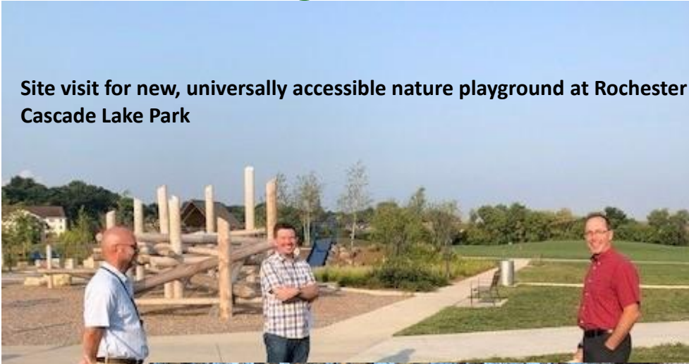
Site visit for new, universally accessible nature playground at Rochester Cascade Lake Park