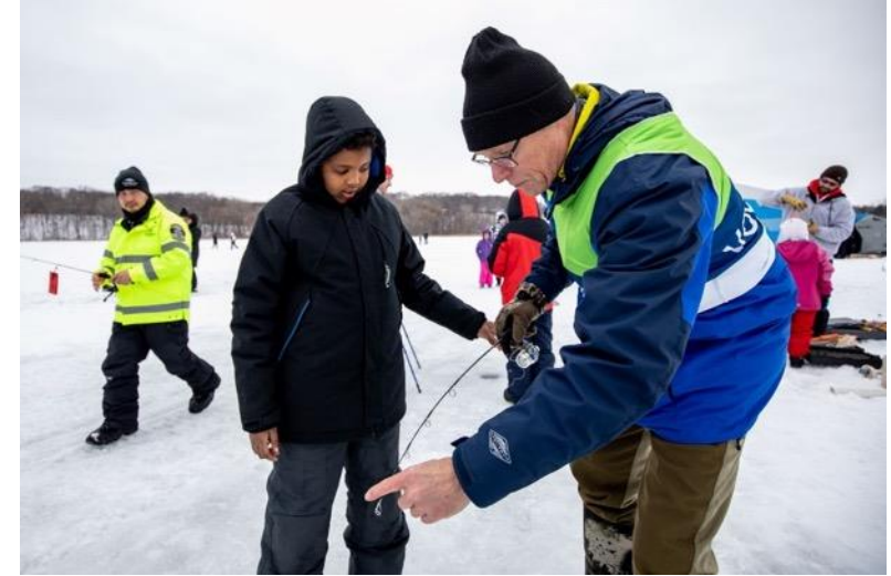
Fish Lake Regional Park