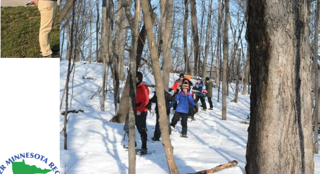
Snowshoeing adventure at Wright County Robert Ney Park