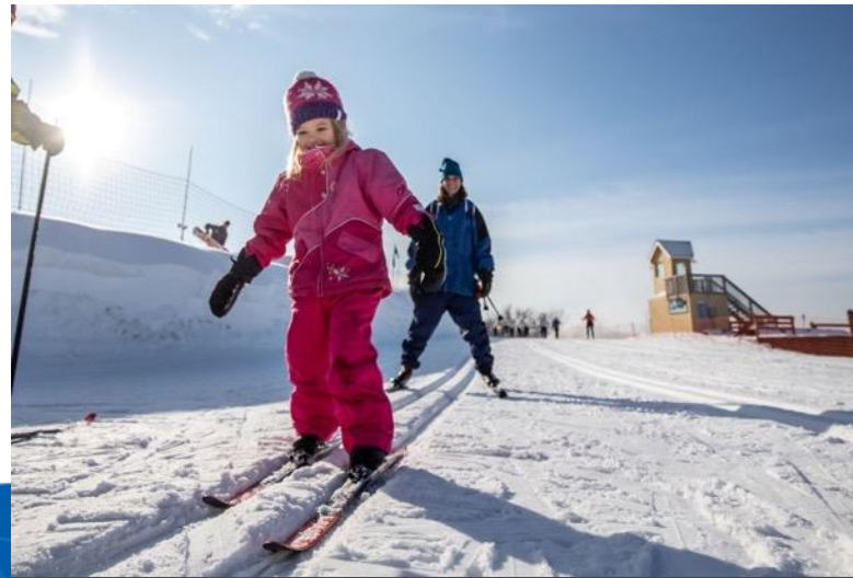
Nordic Opener, Elm Creek Park Reserve Three Rivers Park District