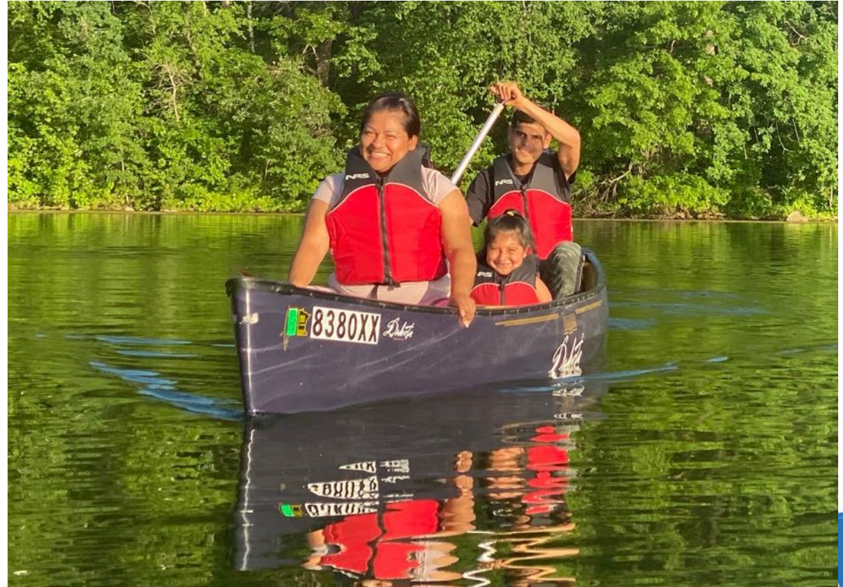
Canoeing, Lebanon Hills Regional Park, Dakota Co.