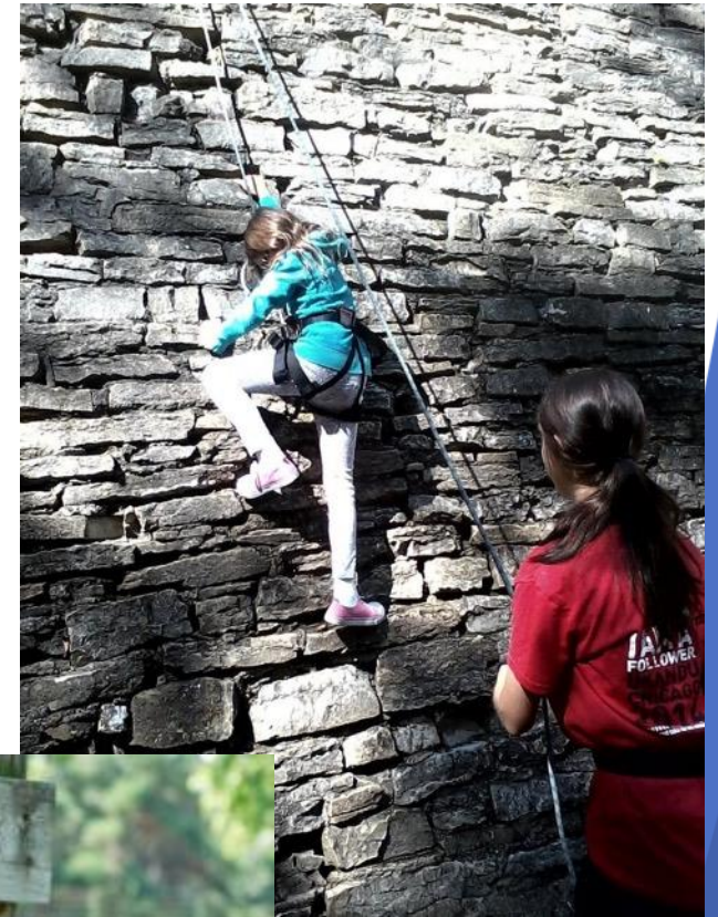
Olmsted County Oxbow Park and Zollman Zoo