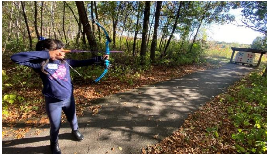
Archery in the Parks, Dakota County