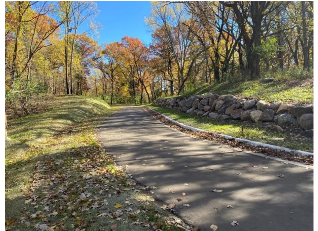
Glacial Lakes State Trail within Sibley State Park Legacy funds provide supplemental funds to make safe, accessible and welcoming trail projects possible