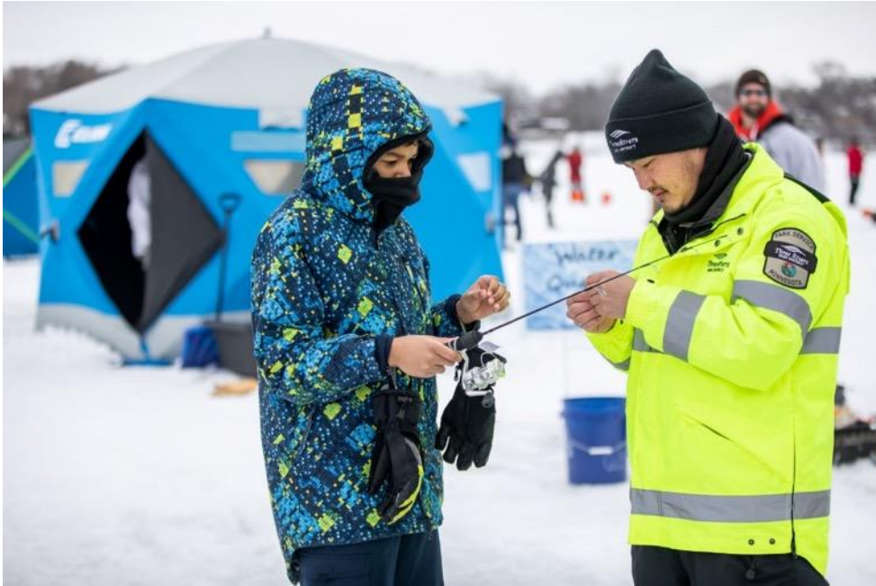
Try It Ice Fishing, Fish Lake Regional Park Three Rivers Park District