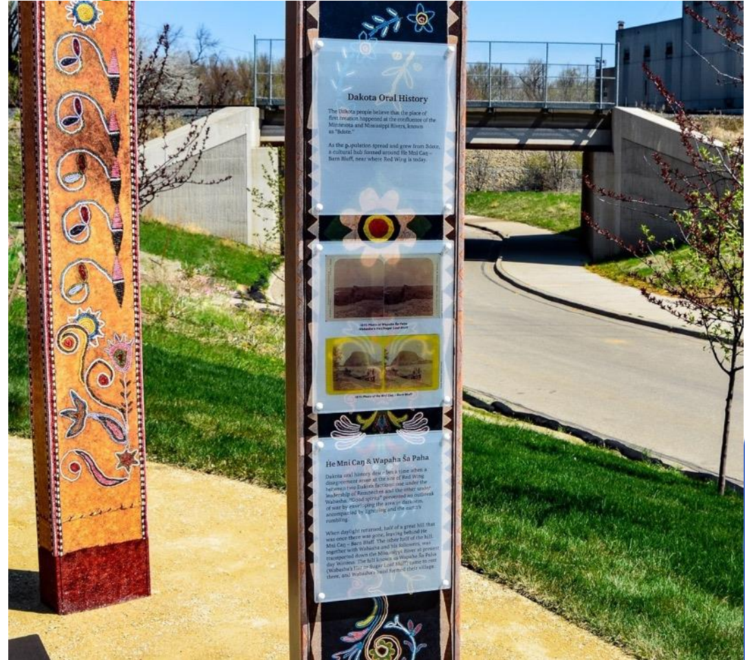
Red Wing He Mni Can – Barn Bluff Park with English and Dakota language interpretive pillars