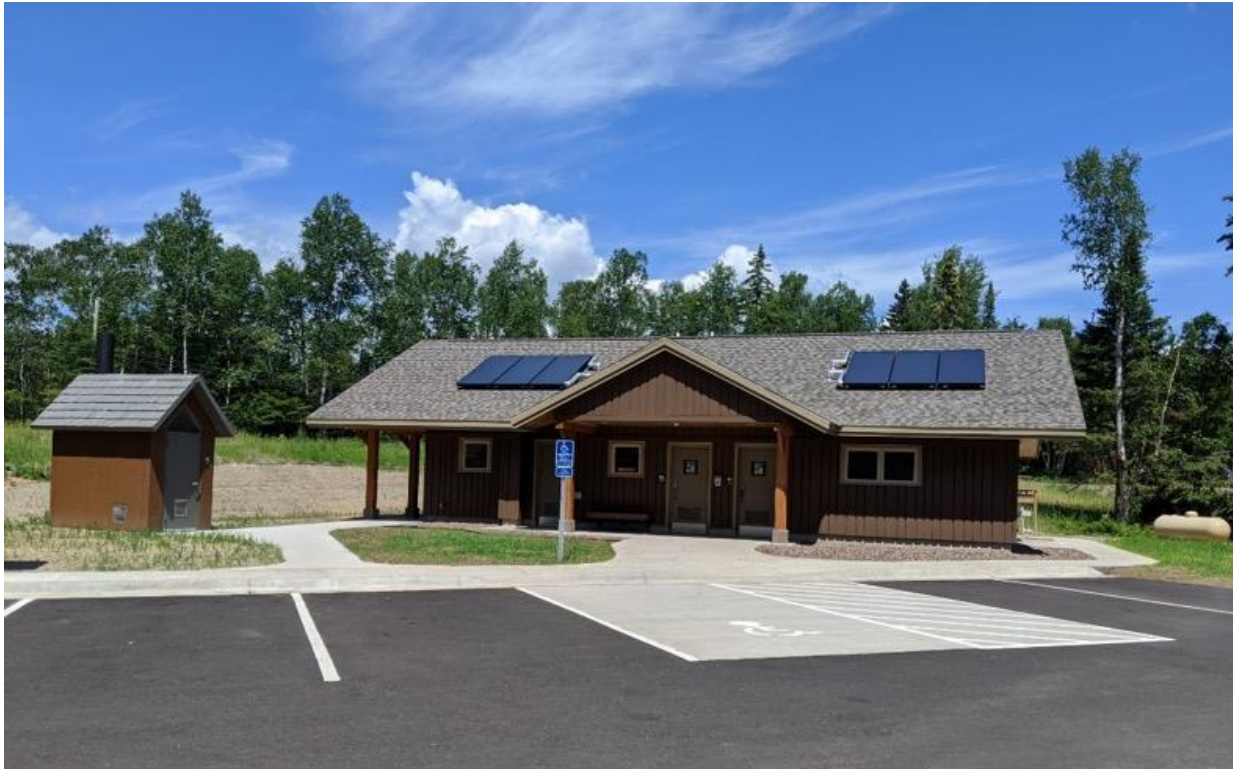
Temperance River State Park – New Shower Building Park users expect clean, modern, family-friendly and climate-friendly facilities.