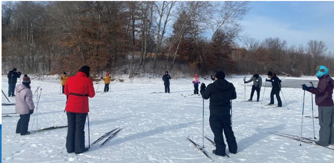
Learn to Ski with Outdoor Latino, Dakota County