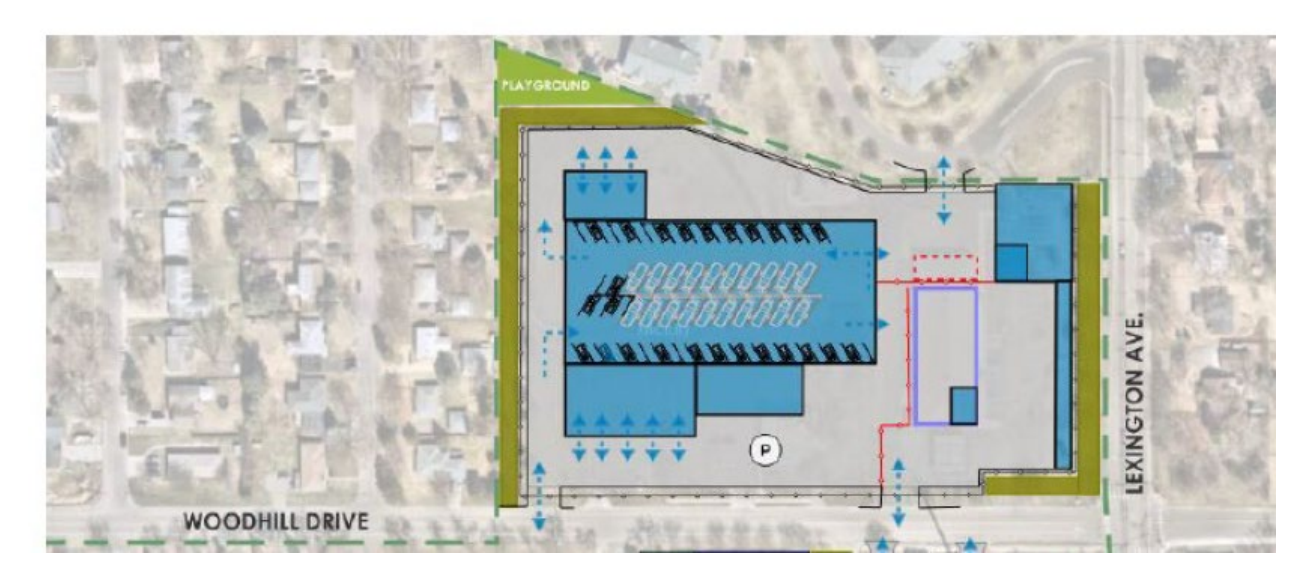
Proposed 100,000 square foot Maintenance Facility on 7.5 acres of land

A new facility will provide a much more efficient, modern, safe and sustainable facility for the future. It will provide space to expand and be flexible enough to reconfigure as maintenance equipment needs evolve and grow. The new facility is estimated to cost $42 million including planning and design, right-of-way acquisition and business relocation, construction and infrastructure required to serve the new facility.