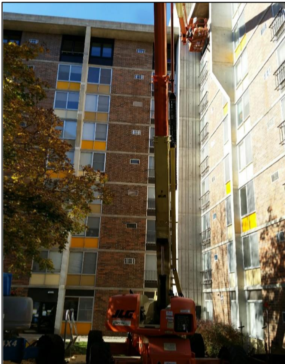
BEFORE: Old Windows