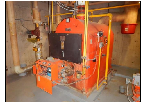
BEFORE: Old Heating System 1974