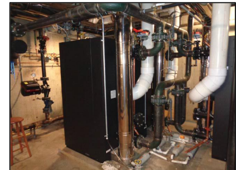
AFTER: New Heating System 2019