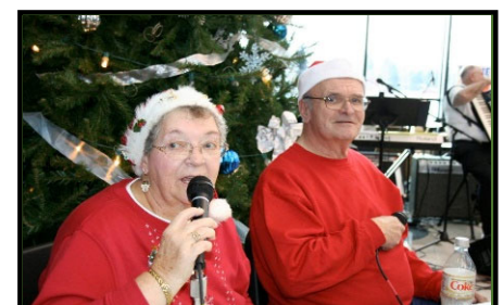
KSQR's "Saturday Morning Barn Dance"