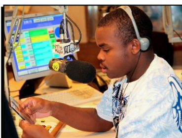
A North High student announcing on KBEM/Jazz88