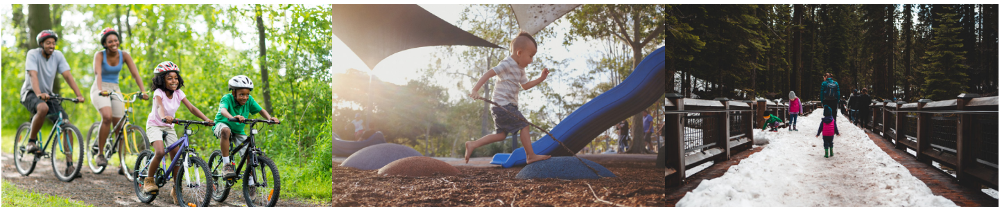
Stats in sidebar are based on 2013 results from "Economic Impact of Local and Regional Park Agencies' Spending" study, conducted for the National Parks and Recreation Association by the Center for Regional Analysis at George Mason University.