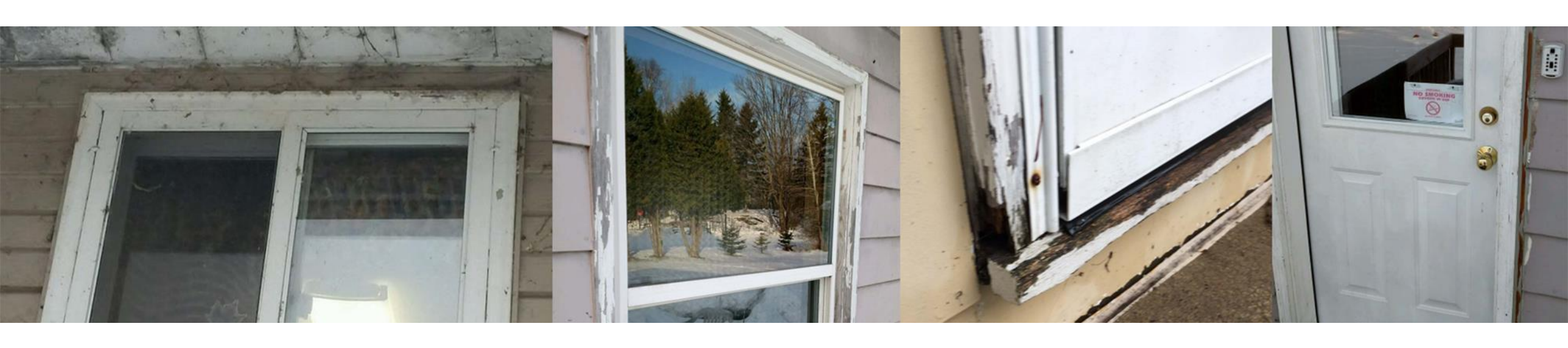
Priority 1: Asset Preservation