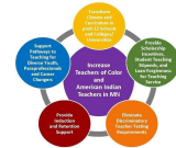
Coalition to Increase Teachers of Color and American Indian Teachers in MN