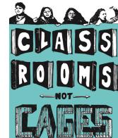
Minnesota Educators Against ICE