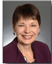
Senator Sandy Pappas

Please call Sen. Pappas' office with questions: 651-296-1802