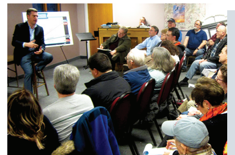
Holding a town hall in Nowthen