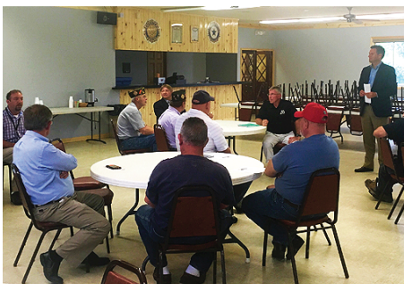
Meeting with veterans in St. Francis