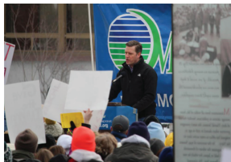
Speaking at MCCL March for Life