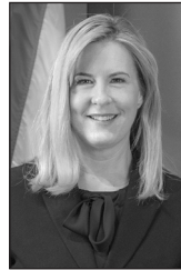
Speaker Emerita Melissa Hortman