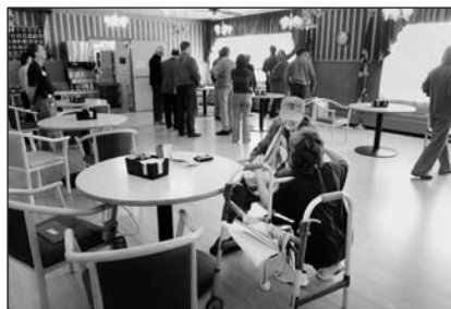
Through the House bill, Silver Bay Veterans Home would receive $227,000 for renovation of existing space and an addition to the nursing care facility. Constructed as an elementary school in 1953, renovations would allow for more clinical and administration space.