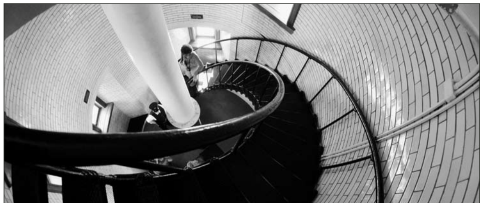
A popular North Shore tourist stop, Split Rock Lighthouse, could see improvement from a portion of an $8 million request from the Department of Natural Resources. The Department of Transportation plans to construct a Highway 61 underpass in 2010, allowing for construction of a new full-service campground.