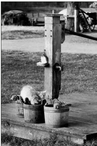
The House bill would allocate $300,000 to revitalize the visitor center at the Oliver H. Kelley Farm Historic Site near Elk River.