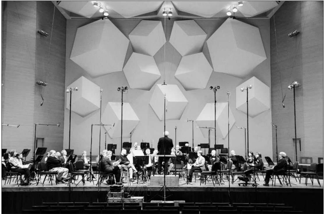
The City of Minneapolis is requesting $3 million for renovation design of the 35-year-old Orchestra Hall and Peavey Plaza in downtown Minneapolis. The funds would pay for improvements that could include an expanded lobby, refurbishing of the auditorium and a new choir loft.