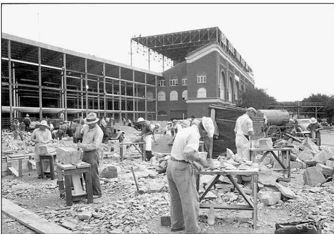
Works Progress Administration rock cutters prepare rock for a stone wall connecting the state fairgrounds’ race track.

In the program’s first six months, Brunfelt said the men fought forest fires, repaired or installed 165 miles of telephone lines, created 48 fire breaks, cleared 3,914 acres of timber slash and 211 miles of dead or damaged timber, built 20 dams and 25 bridges, inventoried 12,708 acres of forest, made improvements to beaches and lakeshores, and trimmed 1,508 acres of trees. 🌲