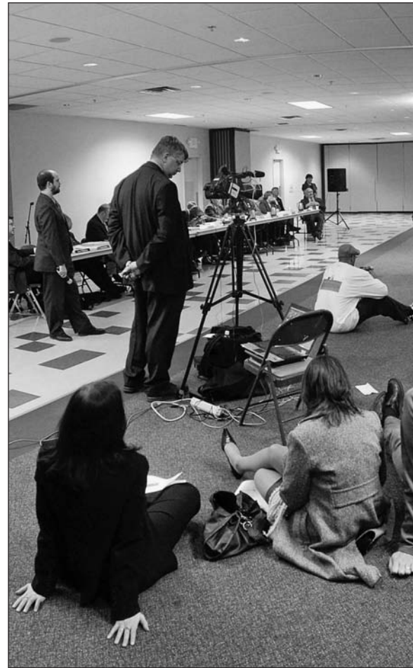
With sitting room only, legislators and citizens hear public testimony at the Feb. 24 House and Senate Budget Listening Session in Minneapolis. Large crowds were common at hearings throughout the state.

Citizens sign up to testify at the House and Senate Budget Listening Session in Minneapolis Feb. 24.